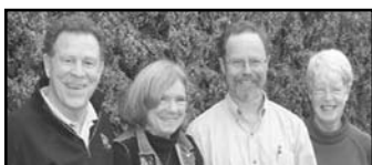
Newsletter Staff (From left)